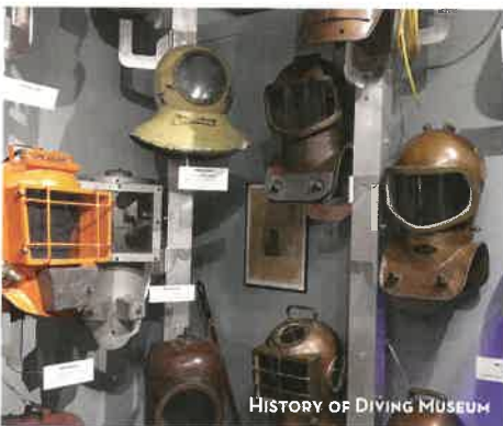
HISTORY OF DIVING MUSEUM